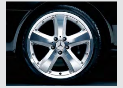
17" "Sadachiba" 5-spoke multi-piece light-alloy wheels Enjoy added design and extra shine from the high-sheen surface of these attractive light-alloy wheels. Roll along on four wheels of pure style.

stowed above you. Strap on your skis and let the attractive design of the roof box speak for itself.