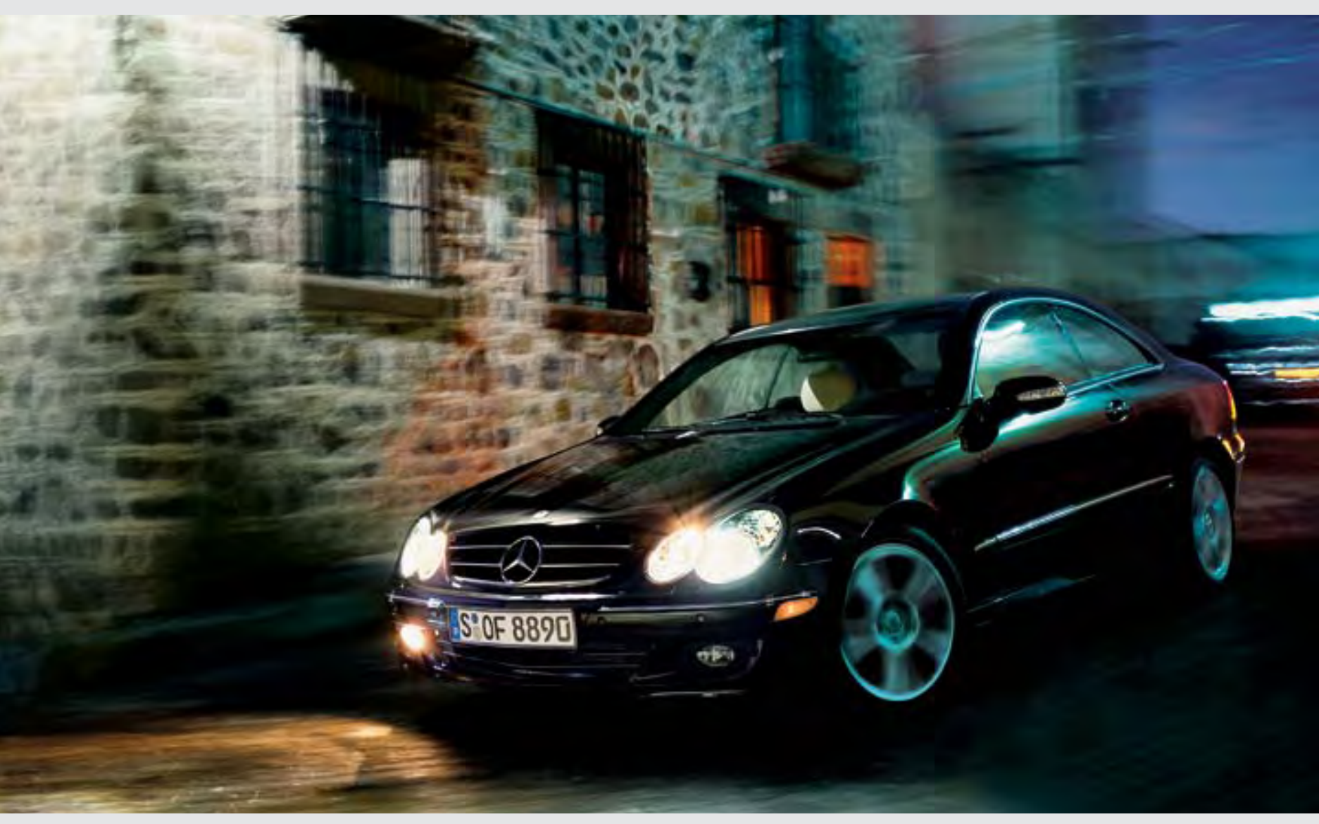
CLK350 Coupe shown with Active Bi-Xenon headlamps.