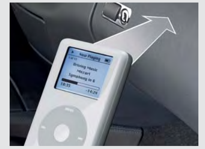
iPod® Integration Kit

You've spent time carefully filling your iPod® with the great music you love. Now you can enjoy every minute of every song as you cruise in your CLK-Class, courtesy of the iPod® Integration Kit.