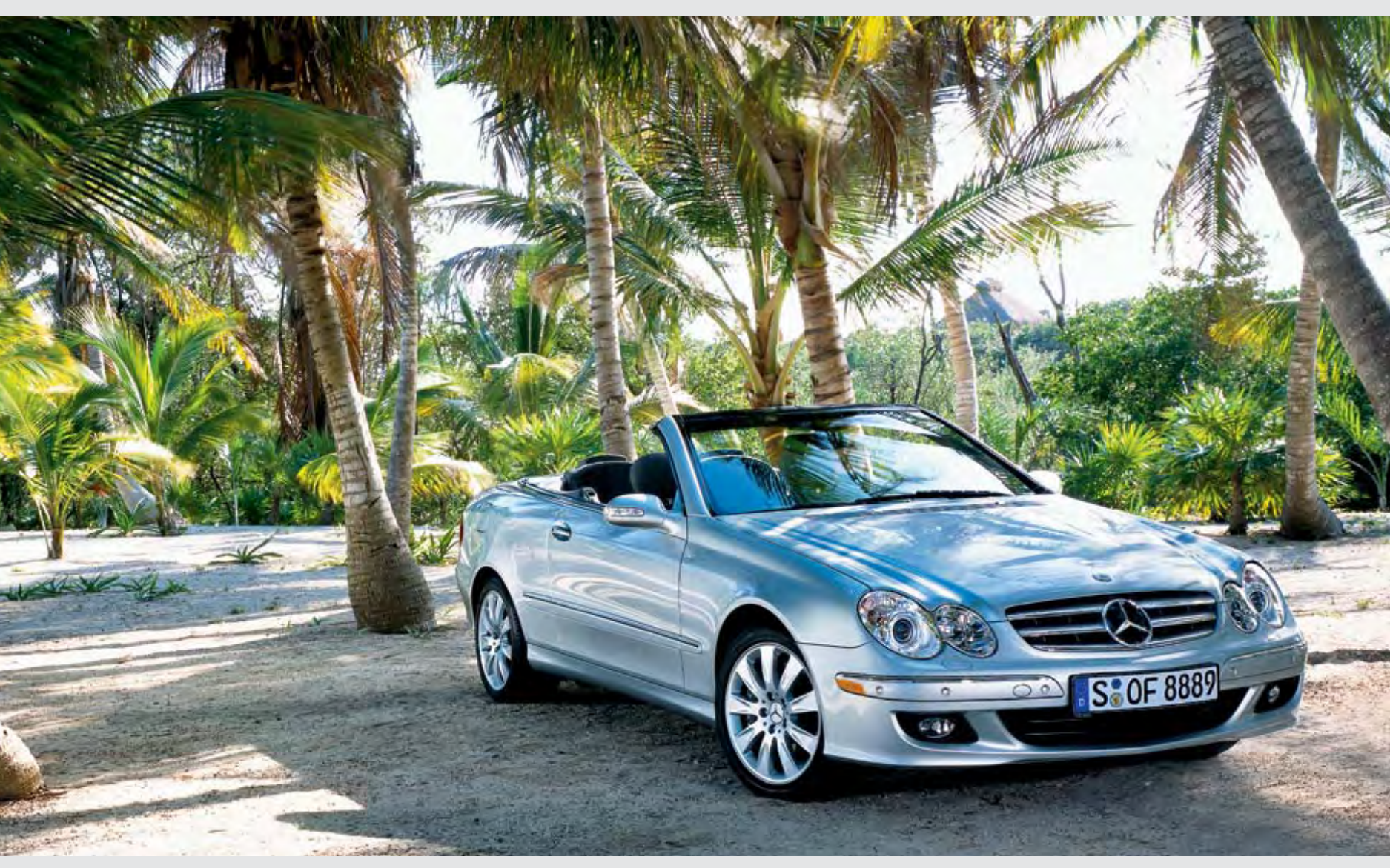
CLK350 Cabriolet shown with optional PARKTRONIC and dealer accessory wheels.