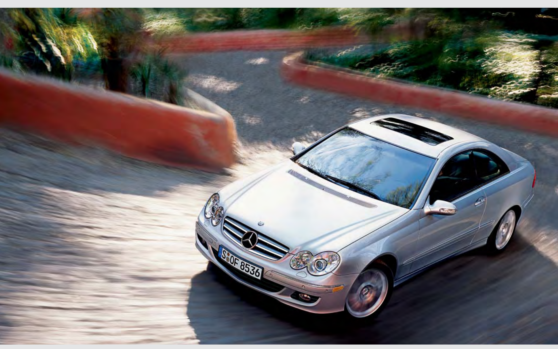
CLK550 Coupe shown with optional PARKTRONIC.