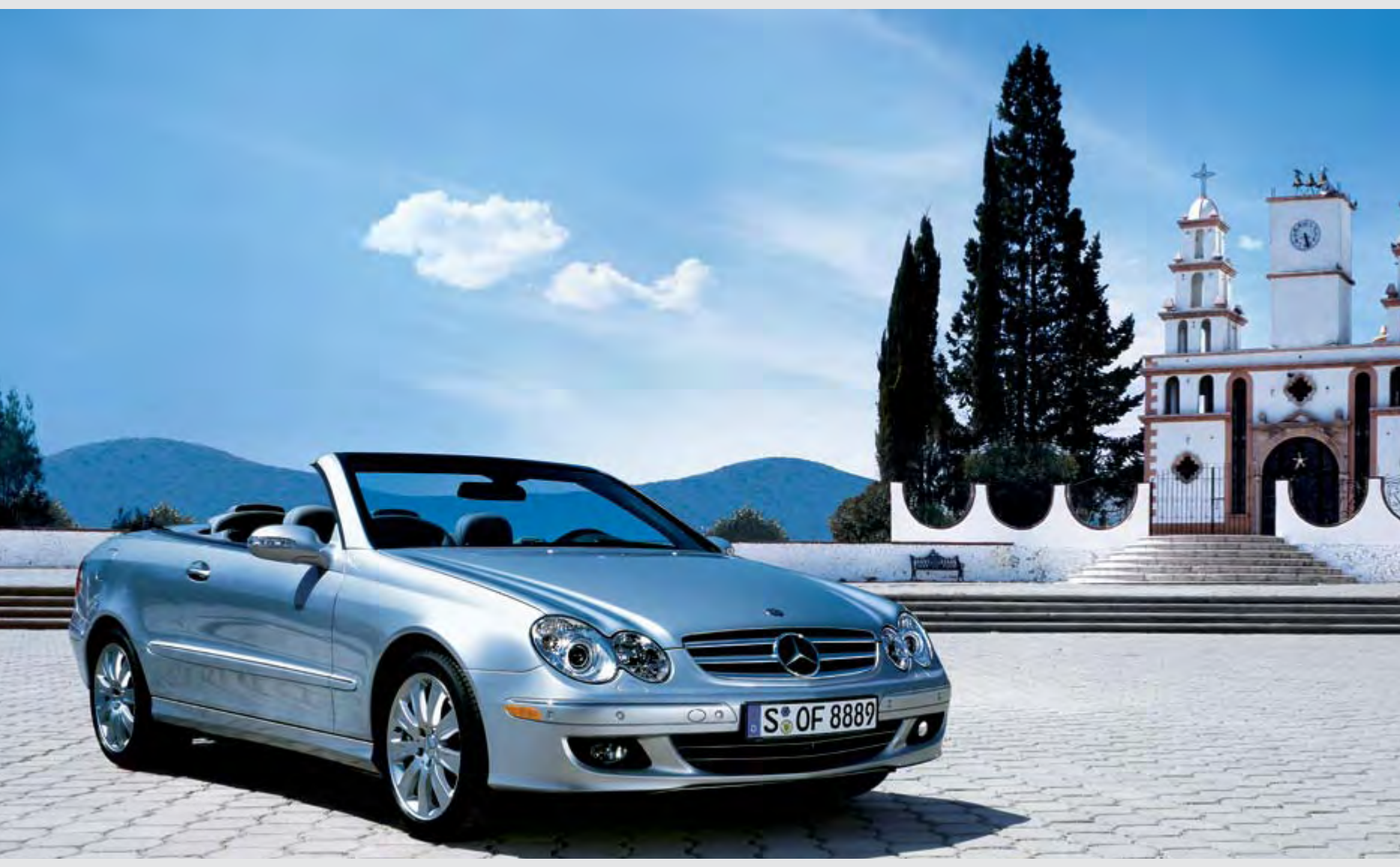
CLK350 Cabriolet shown with optional PARKTRONIC and dealer accessory wheels.