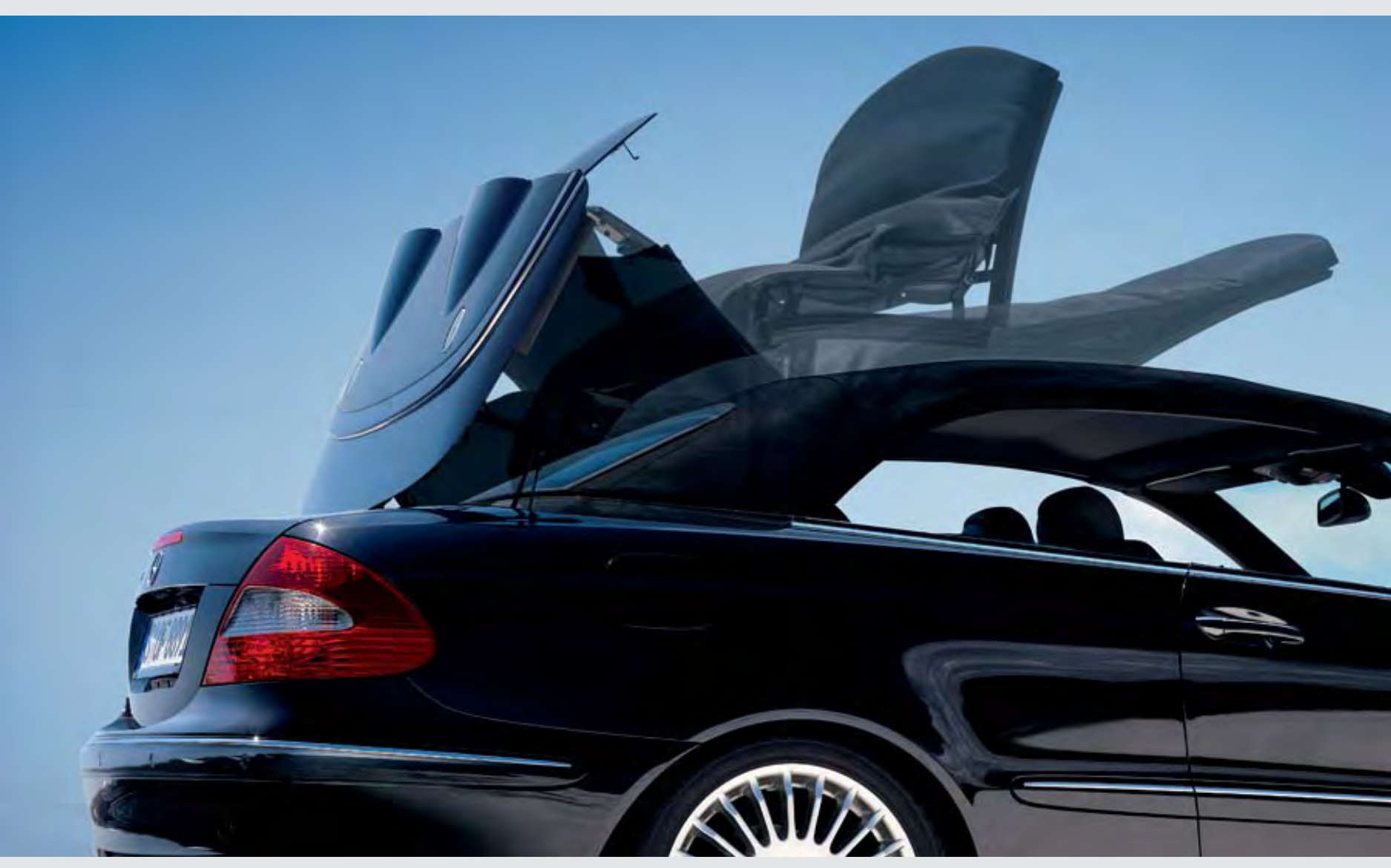
{\it CLK350 \ Cabriolet \ shown \ with \ optional \ PARKTRONIC \ and \ dealer \ accessory \ wheels.}