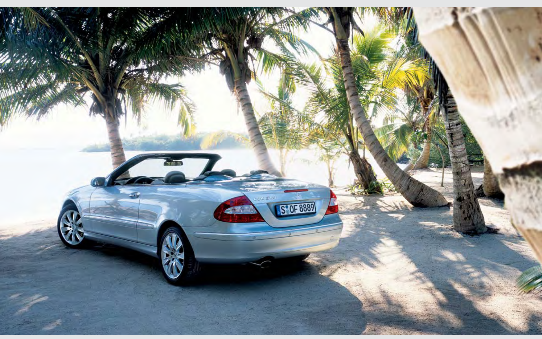
{\it CLK350 \ Cabriolet \ shown \ with \ optional \ PARKTRONIC \ and \ dealer \ accessory \ wheels.}