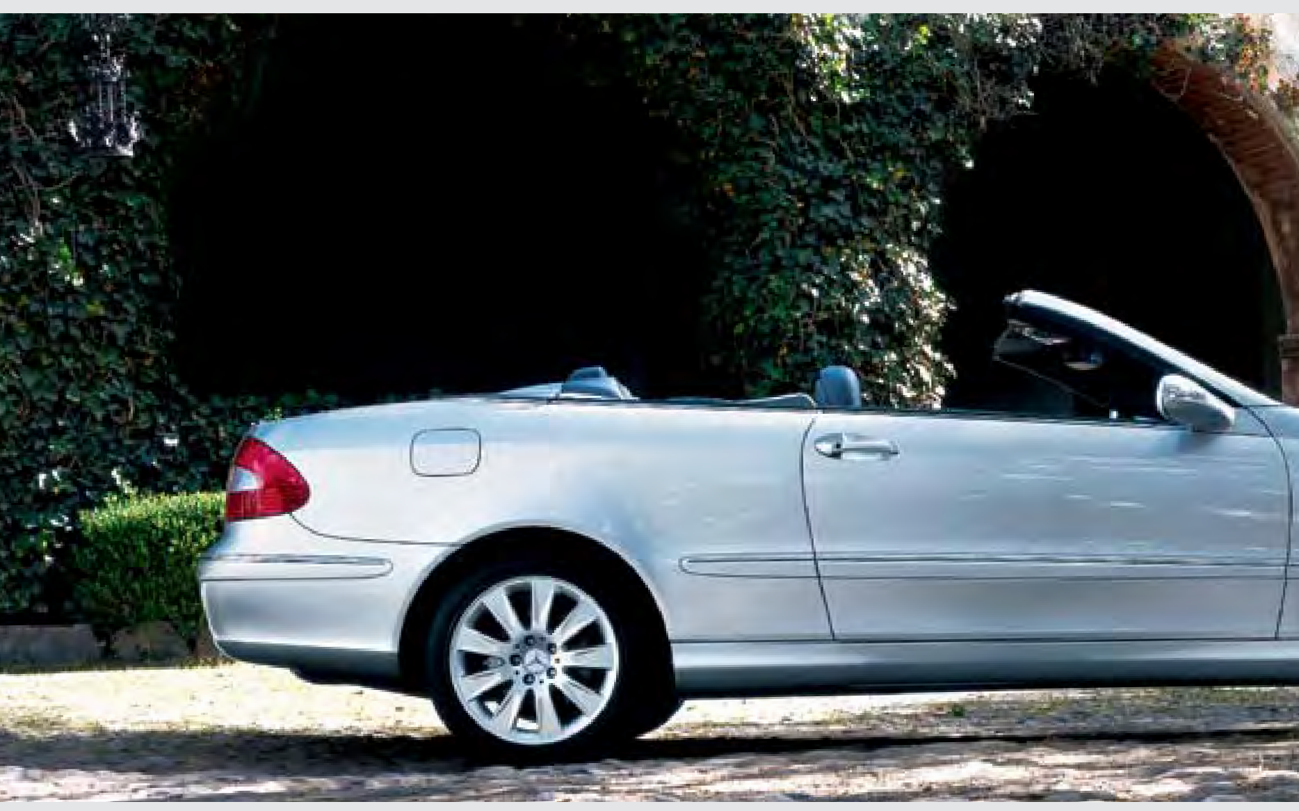
CLK350 Cabriolet shown with dealer accessory wheels.