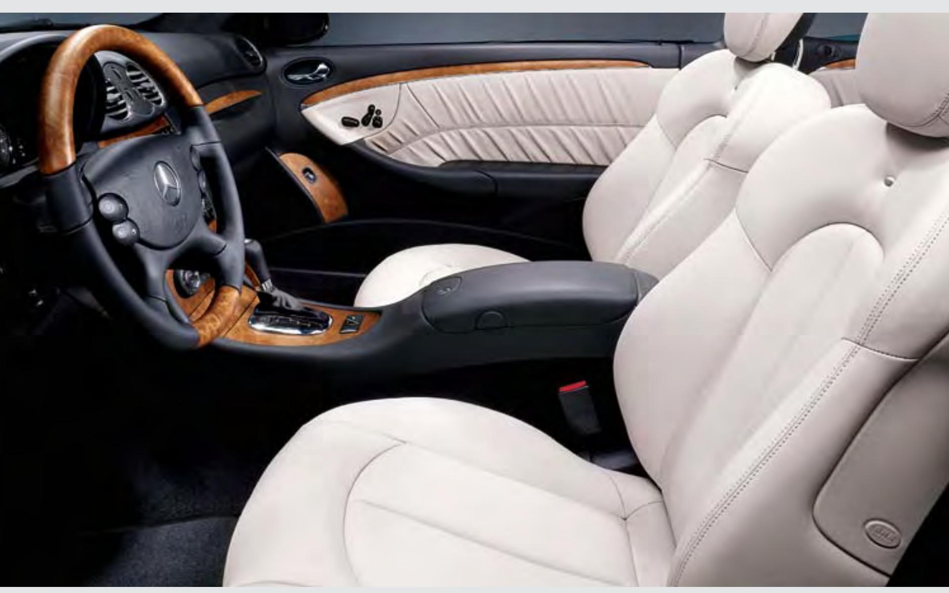
\it CLK350 shown with designo interior.