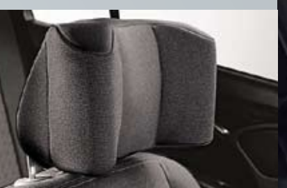
Luxury head restraint cover Anthracite. For the head restraints