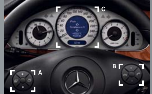
Mercedes-Benz iPod® Interface Kit*

It's easy to control your iPod via the multifunction steering wheel: scroll through the menus [A], adjust the playback and volume [B] and display the artist/title of your choice in the instrument cluster [C].