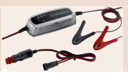
Charger with trickle charge function

With its cutting-edge technology, the Mercedes-Benz charger ensures the longest possible life for the battery