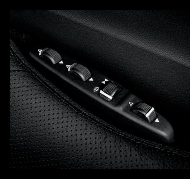
Rugged. Every G-Class is crafted almost entirely by hand in Graz, Austria. Its galvanized steel body is welded at over 6,000 points for strength. Its rigid frame is treated with 50 liters of wax to resist corrosion. From looming its wiring to outfitting its luxurious, roomy cabin, each vehicle it takes over 40 hours to build. But it creates a lifetime of durability.