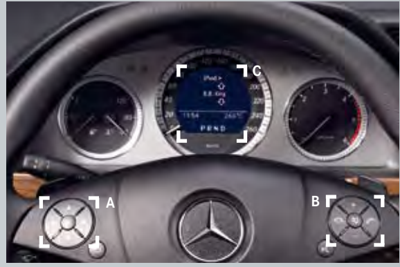
Mercedes-Benz iPod® Interface Kit3

It's easy to control your iPod via the multifunction steering wheel: scroll through the menus [A], adjust the playback and volume [B] and display the artist/title of your choice in the instrument cluster [C].