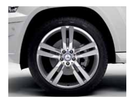
20" 5 twin-spoke wheels.

The GLK-Class wheels were designed with the same philosophy as the rest of this inspired vehicle. Style, substance and safety are the cornerstones of Mercedes-Benz, and none of these attributes were spared while developing these impressive wheels.