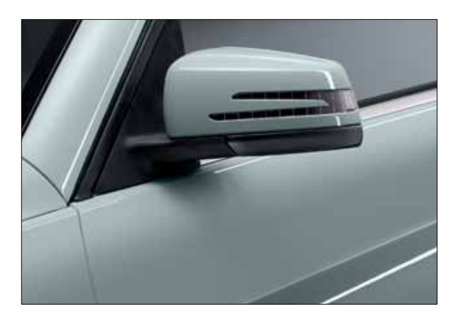
Power adjustable heated exterior mirrors.

The absolutely unique design of the GLK-Class is based on striking lines and represents a bold departure from conventional styling. Distinctive lines dominate the door areas between the accentuated wheel arches while a powerful and angular front hood gives the GLK-Class a stylized character. With standard 20" 5 twin-spoke wheels, and aluminium roof rails, the styling of the GLK-Class sends out a clear message, no matter which angle it's viewed from. Functional Active Bi-Xenon headlamps¹ and LED daytime running lights add to the already striking appearance of the 2012 GLK-Class.