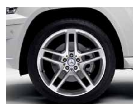
20" AMG 5 twin-spoke wheels.