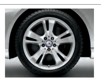
18" split 5-spoke<sup>2,24</sup> (E350 Sport Sedan)